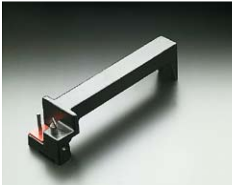
NAGEL drill bit sharpener for quick on-site resharpening